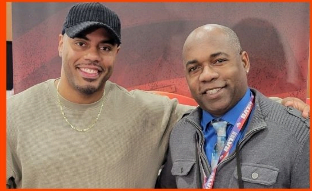
RASHAD JENNINGS FORMER NFL RUNNING BACK