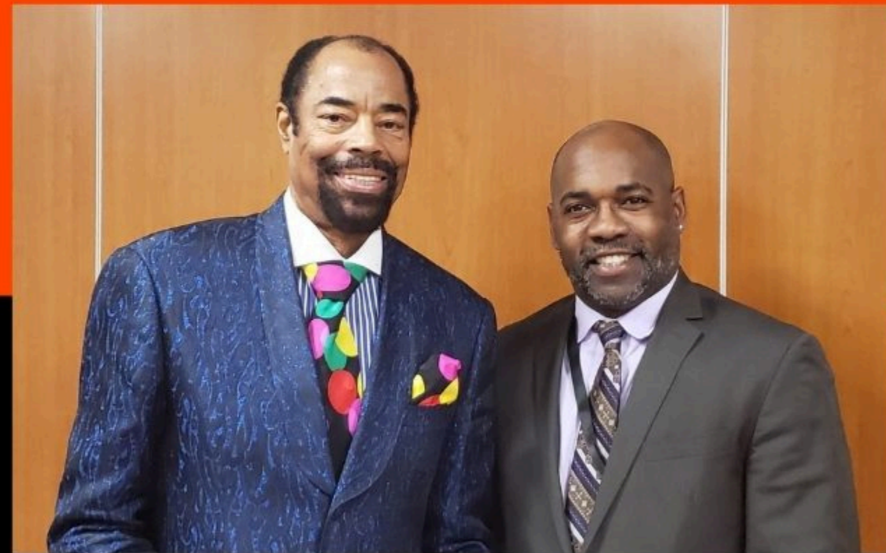
WALT FRAZIER NBA HALL OF FAME PLAYER