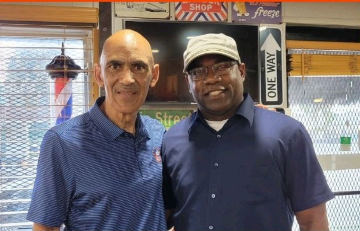
TONY DUNGY NFL HALL OF FAME COACH

The Sports Arena has spirited, transparent conversations within the sports world. We dive into topics with thoughtfulness and empathy striving to be a voice for positivity. By having uncomfortable conversations, we use our grassroots platform to push for the advancement of all who have been undervalued.