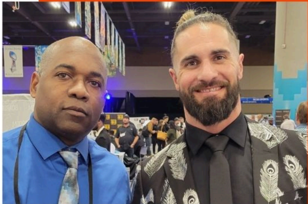
SETH ROLLINS PROFESSIONAL WRESTLER