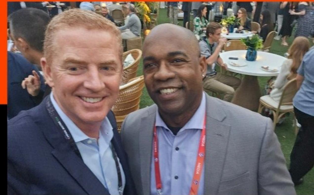
JASON GARRETT NFL PLAYER & COACH