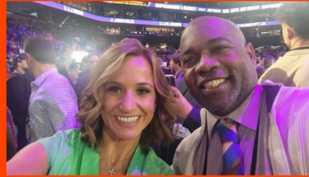
DIANA RUSSINI AMERICAN SPORTS REPORTER